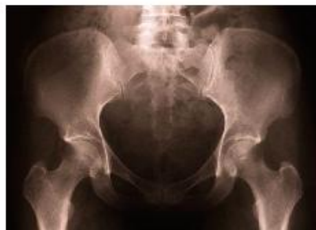
Common sites of bone fractures include: hip, spine, wrist, pelvis and ribs

Osteoporosis is a condition that develops when bone tissue and key bone minerals are lost faster than they are replaced. Bone mass is lost, and as a result bones become weak and porous, meaning that they become easier to break. Osteoporosis develops over time without any symptoms. Many people do not realize they have osteoporosis until a bone breaks.